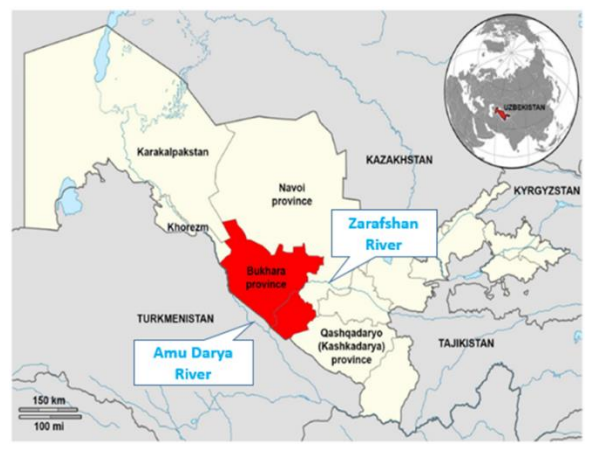
Fig.1 The map of Bukhara province, Uzbekistan

The study area is located in Bukhara Province of Uzbekistan. Bukhara Province is located in the downstream of Aral Sea basin and irrigated by Amu Darya and Zarafshan rivers (Fig. 1), with the range altitude of 206 - 229 m ASL. The province has mean annual temperature of -7°C in winter and +34°C in summer and an average annual precipitation of 280-350 mm. The province located in arid and continental climatic zone.